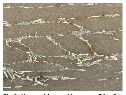
Fig. 3. Hot-working problems on a D2 roll

In addition to a large number of inclusions, cracking during solidification and hot working may introduce flaws that